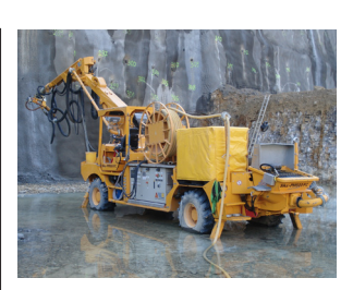
SikaCare Reduces the adhesion of cement mortar and concrete to the equipment, allowing extended use, lower wear and easier cleaning after the application.