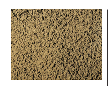
SikaTell® Colloidal silica additive for stabilizing the concrete mix cohesion and thereby reducing rebound and improving the long-term durability of the shotcrete.