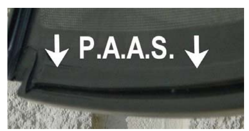
(PAAS on Saint Gobain FW02072 for New Beetle)

PAAS stands for Pre-Applied Adhesive System and an example of one of these types of parts is shown above. Modern PAAS glass parts are designed to act as a height-guide when installing fresh adhesive. However, a PAAS system can also get easily contaminated from shipping and handling. To prepare a PAAS windshield, wipe the bond area of the pre-applied adhesive with Sika® Aktivator PRO and wipe off to remove any debris. Remember to allow Sika® Aktivator PRO to flash off for 10 minutes, regardless of temperature, whenever it is applied directly to trimmed urethane. In some cases, the pre-applied adhesive may need to be trimmed down to allow room for the new urethane adhesive. In these cases, it is not necessary to apply Sika® Aktivator PRO to the freshly cut bonding area exposed by the trimming of the pre-applied urethane adhesive.