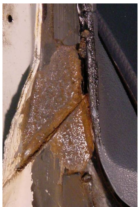
(Level 2 – 3 corrosion of pinchweld)