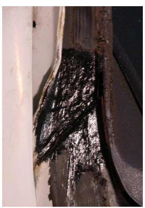
(Same area treated using treatment process)