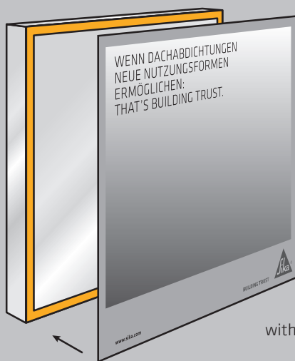
Metal to metal with Sikaflex®-552 AT or Sikaflex®-953 .