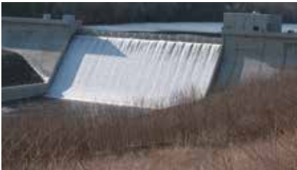
HONORABLE MENTION: Water Structures Category