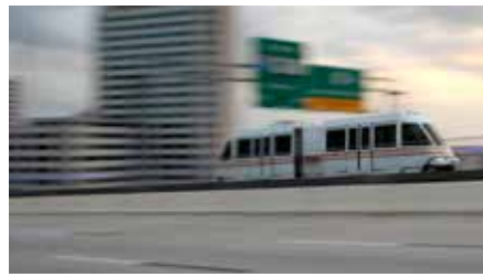
HONORABLE MENTION: Transportation Category