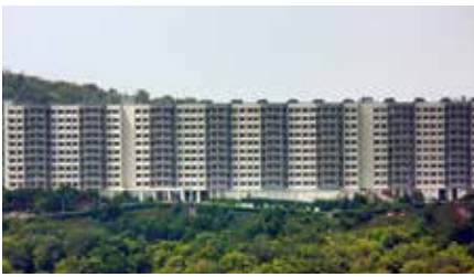
HONORABLE MENTION: High-Rise Category