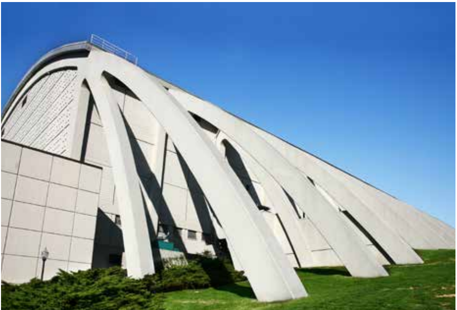
Cassel Coliseum, Lyndhurst NJ

Exterior Renovations to Cassell Coliseum Lyndhurst, New Jersey